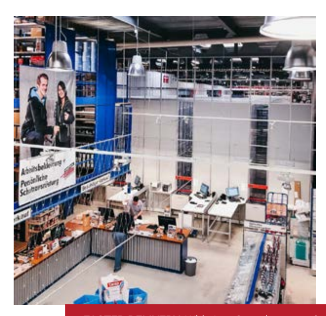
FASTER DELIVERY: With AutoStore integrated into the shop customers receive their goods even faster.

One company that invested in automation in a local warehouse is the Swiss-based Peterhans. They